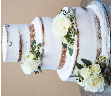
Peek A Boo