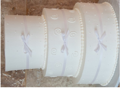
White Dots & Bows