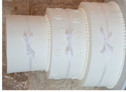
White Dots & Bows